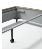
BAR FOR SINGLE BED FRAMES